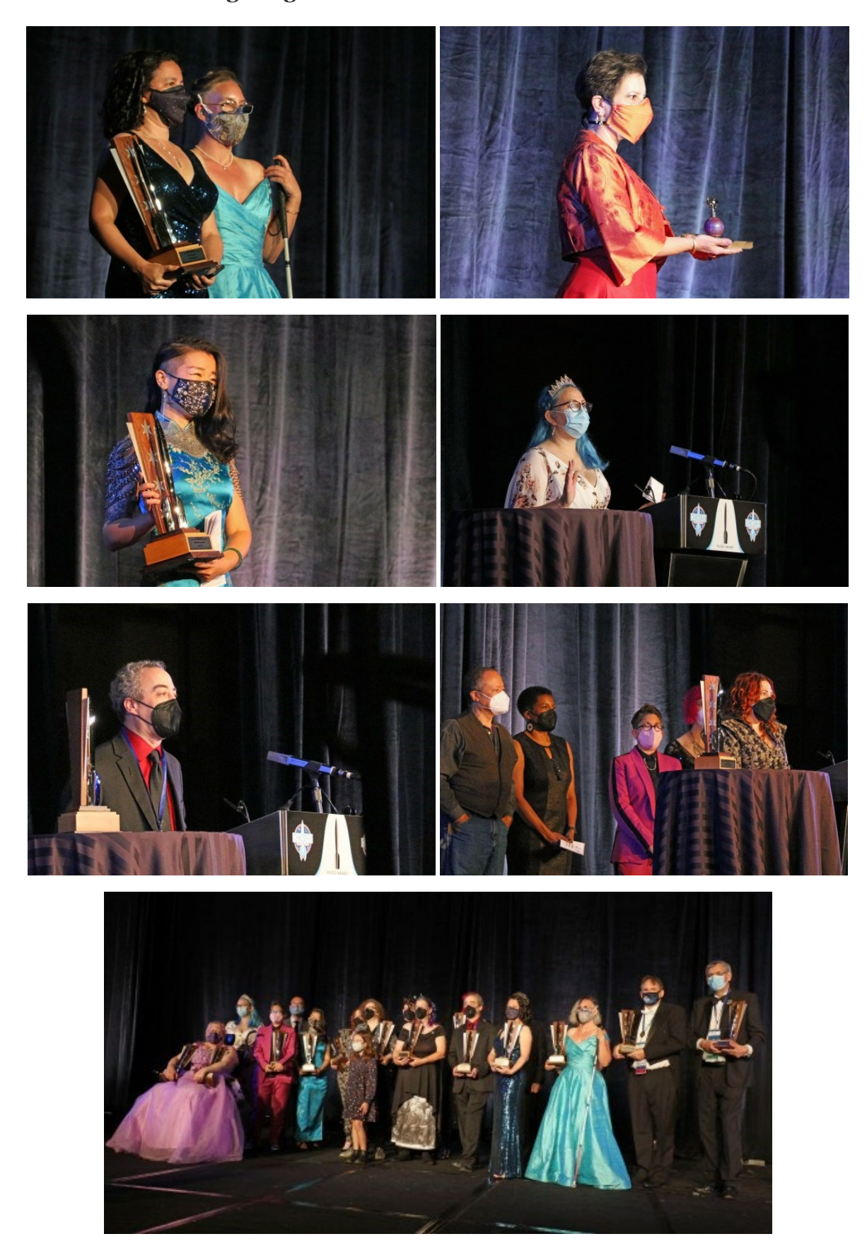
One Enchanted Evening: Hugos 2022